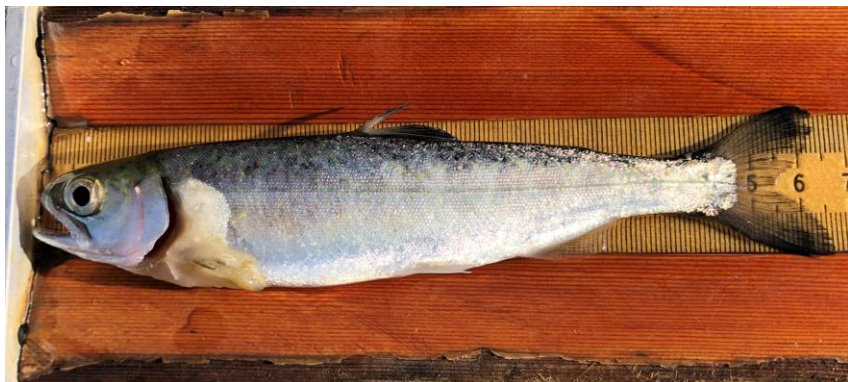
Moribund yearling Chinook with fungus.