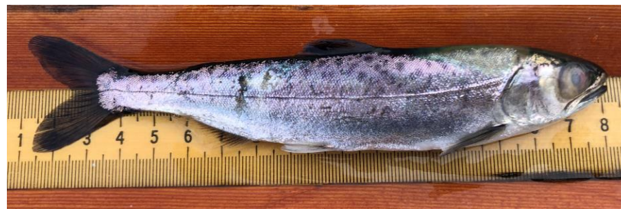
Yearling Chinook mort with eye injury and fungus.